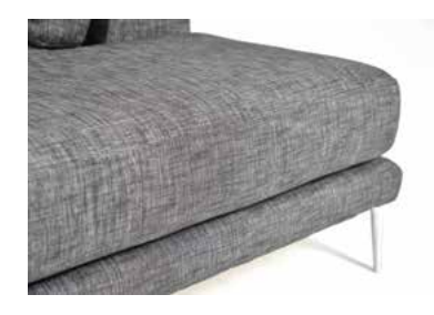
Now available with tailor made removable covers